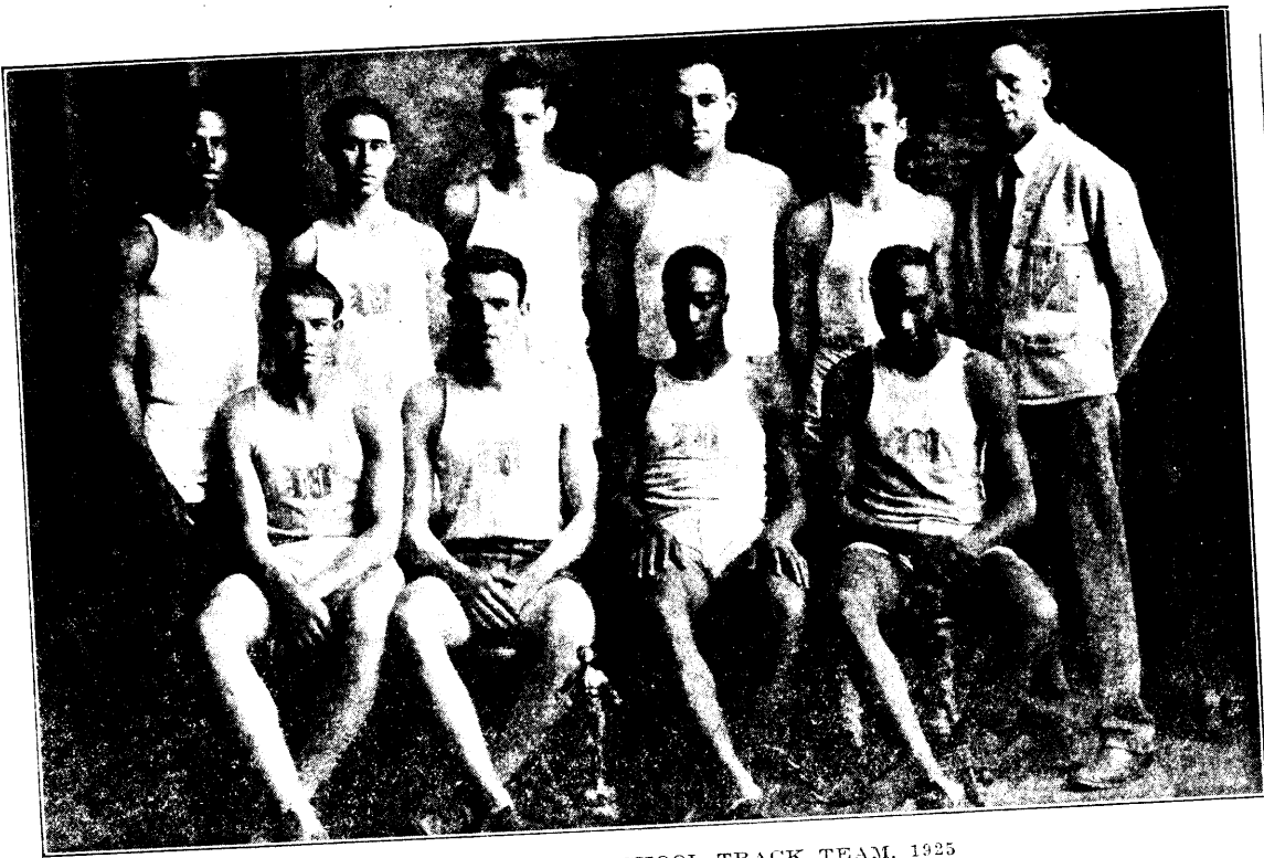
WINFIELD HIGH SCHOOL TRACK TEAM, 1925 (See note on opposite page.)