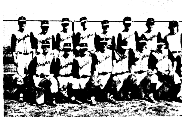
Victoria High School